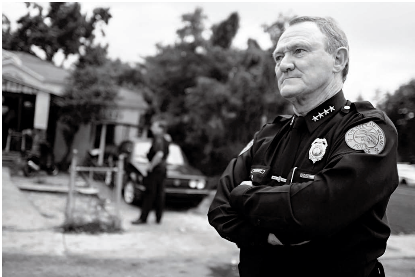
Police Chief John Timoney is a respected reformer, but his work has been a burden to his family.

straps—pink if possible. In Philadelphia, where he was police commissioner for four years, he had his force trade in their blackjacks for pepper spray, and he gave women's groups the right to review sex-crime cases. Timoney speaks in what a friend calls a Bronx brogue, an accent that evolved from a childhood spent in Dublin and Washington Heights. (When Timoney was twelve, the family moved from Ireland to New York to join his father, who had found work as a doorman on Fifth Avenue.) He can be abrupt and defensive when dealing with critics—reporters have found him to be exceptionally thin-skinned—and he has got into trouble for his occasional outbursts, perhaps most memorably during a blowup at Rudolph Giuliani when he